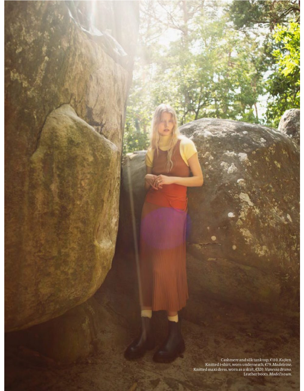
Cashmere and silk tank top, €110. Kuften . Knitted t-shirt worn underneath, €79. Madeleine . Knitted maxi dress, worn as a skirt, €320. Vanessa Bruno . Leather boots. Model's own .