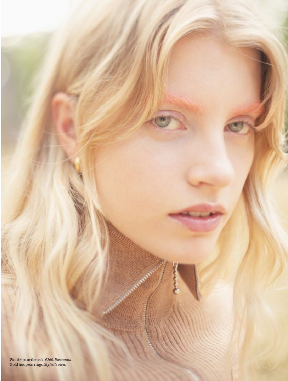
Wool zip turtleneck, €260. Roseanna . Gold hoop earrings. Stylist's own .