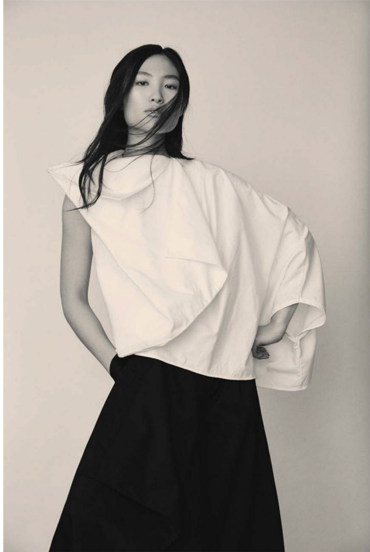
Blouse & Pants by Sapideh Ahadi