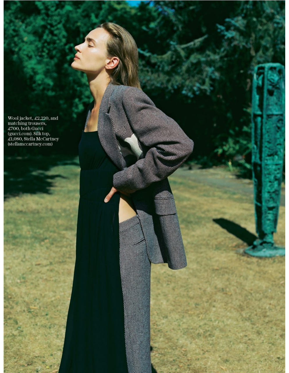
Wool jacket, £2,220, and matching trousers, £700, both Gucci ( gucci.com ). Silk top, £1,080, Stella McCartney ( stellamccartney.com )