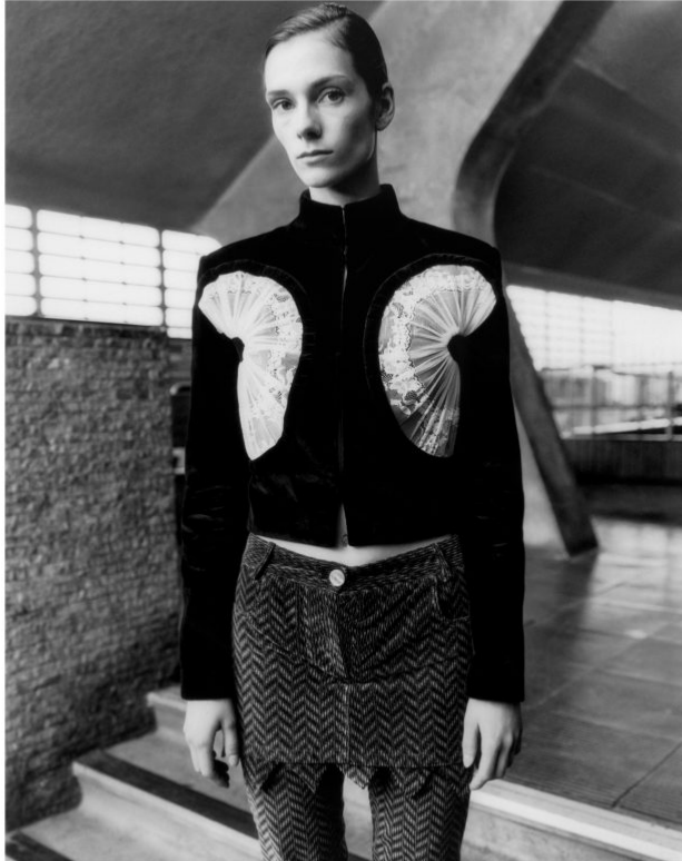
jacket FIDAN NOVRUZOVA, trousers KATYA ZELENTOVA • jacket FIDAN NOVRUZOVA, trousers KATYA ZELENTOVA • jacket FIDAN NOVRUZ