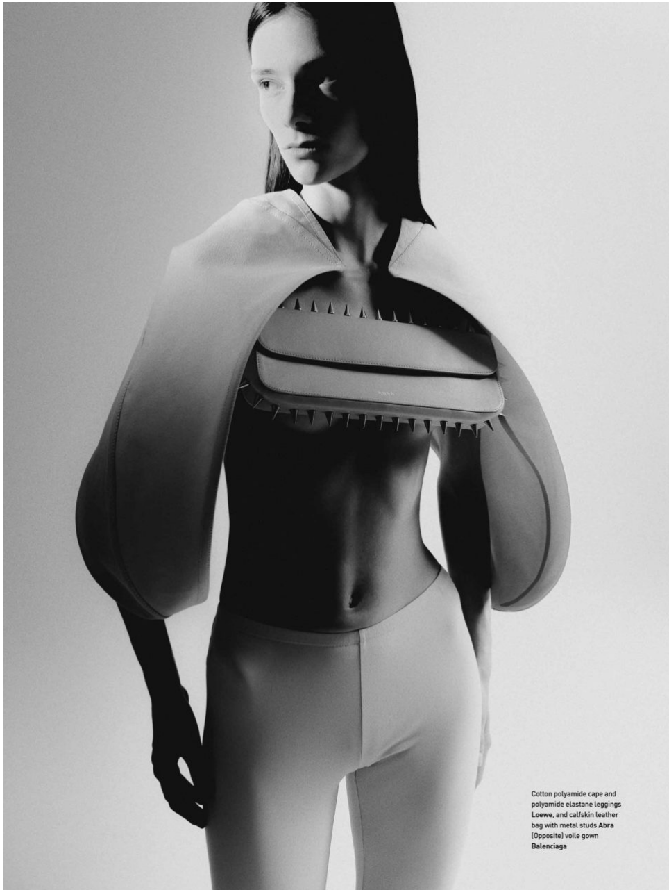
Cotton polyamide cape and polyamide elastane leggings Loewe, and calfskin leather bag with metal studs Abra (Opposite) voile gown Balenciaga