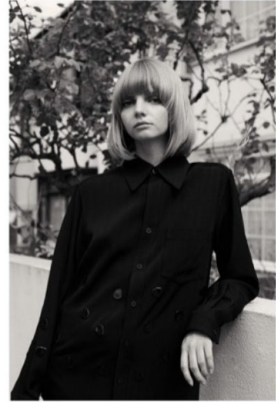
Black rayon Slab shirt and trousers by TOGA. Black patent brogues by MALONE SOULIER.